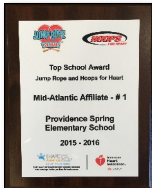
#1 School Award, Mid-Atlantic

On September 27, PSE was recognized by the American Heart Association for its outstanding support of their research efforts through the money raised in last year's Jump Rope for Heart. All of you PSE families pitched in and raised $42,000 , an incredible amount of money for a very worthy collective goal. Thanks to you, our walls have three new plaques.