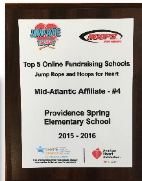
#4 School in Online Fundraising, Mid-Atlantic