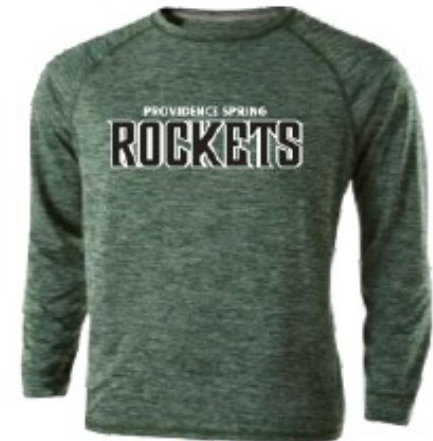
Long Sleeve Performance Tee Heather Green Providence Spring Rockets Logo