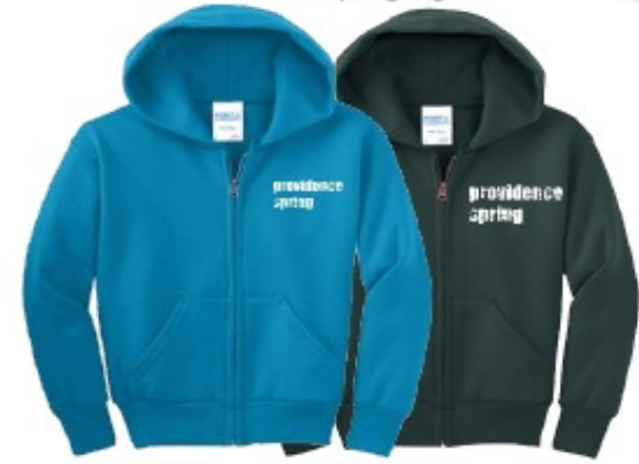
Full Zip Hooded Sweatshirt Neon Blue and Forest Green Providence Spring Logo