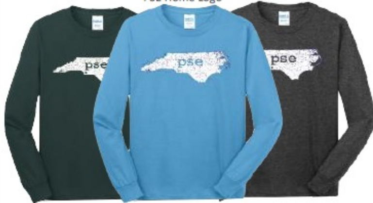
Long Sleeve T-shirt Forest Green, Aquatic Blue, or Dark Heather Gray PSE Home Logo