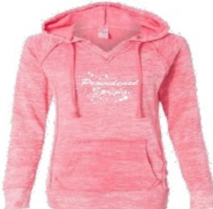
Burnout Hooded Sweatshirt -Deep Coral Providence Spring Paint Splatter Logo Runs Small