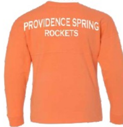
Long Sleeve Game Day Jersey - Coral Providence Spring Logo on BACK. Oversized