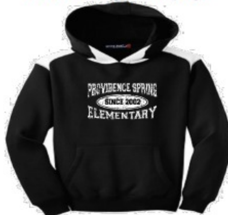
Black with White Hooded Sweatshirt Providence Spring Elementary Logo