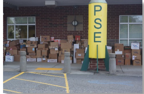
Donations were piled high along the front walkway.

Our “Let’s Love Our Community” Loaves & Fishes food drive was an overwhelming success, as we collected 14,244 items!! Whether your student brought in one can or 100 cans, we ALL helped to make this goal a reality. As always, we couldn’t have pulled this off without the help of our many volunteers who helped put together boxes, sort, load, etc. THANK YOU!!