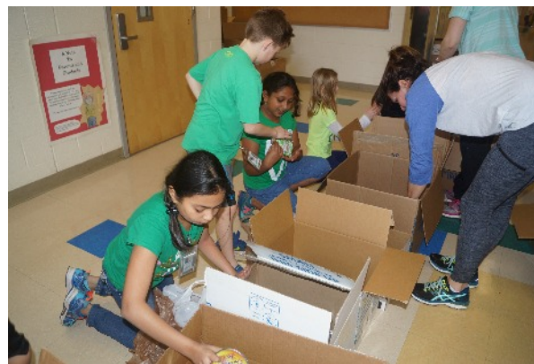
Students and parents helped sort and box donations.

Please make sure your child understands that this food will help feed thousands of people right here in Charlotte for months and months to come. We’re so grateful for your generosity and dedication to making not just our school, but our whole community, a better place.