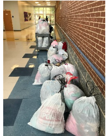
Coats bagged up for transport.

The PTA served our annual lunch to the staff at the Metro School (our sister school where most students have severe cognitive disabilities and require full physical care) in December, and it was delightful to hear how grateful they are for what we've given them, but also to realize we have much to learn/take-away from them.